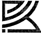
EÖTVÖS KÁROLY POLICY INSTITUTE