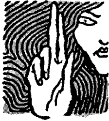
Hungarian Helsinki Committee